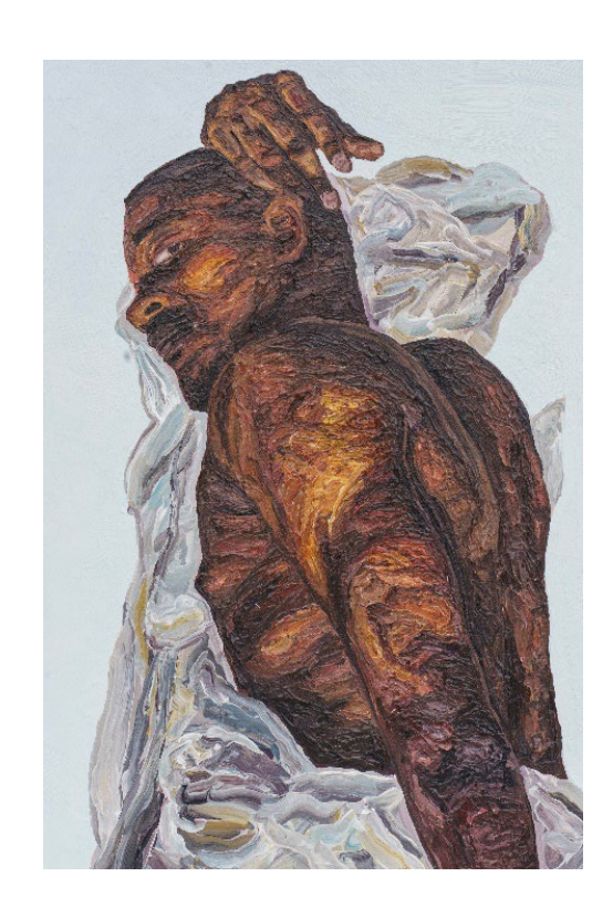
(3) Sans titre, 2022, 180 x 110 cm, acrylic on canvas (4) Voile #5, 2024, 130 x 110 cm, acrylic on canvas